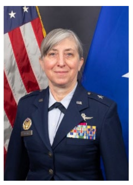
Brigadier General Kimberly (Jones) Baumann '87

GFOs make up less than 0.4% of the officer corps. The first woman promoted to general and flag officer ranks did not occur until 1970. The following year, the Reserve Officers' Training Corps (ROTC) commissioned its first female flag officer. Both occasions represented a significant milestone in the evolution of military leadership. Nearly 48 years later, Norwich University's first alumna was promoted to general officer.